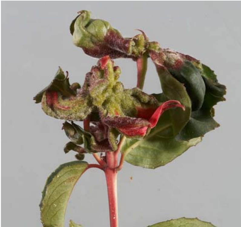
Figure 1. Gross shoot tip distortion in Fuchsia sp. infested with Aculops fuchsiae Keifer the Fuchsia gall mite.